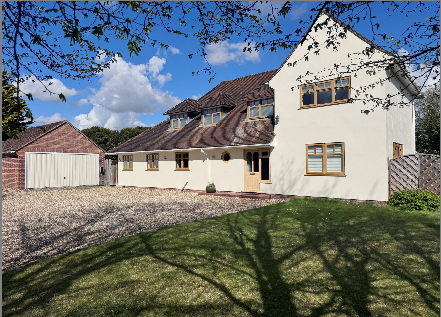
SQUERRYES , Round End, Wash Common, South Newbury , RG14 6PL